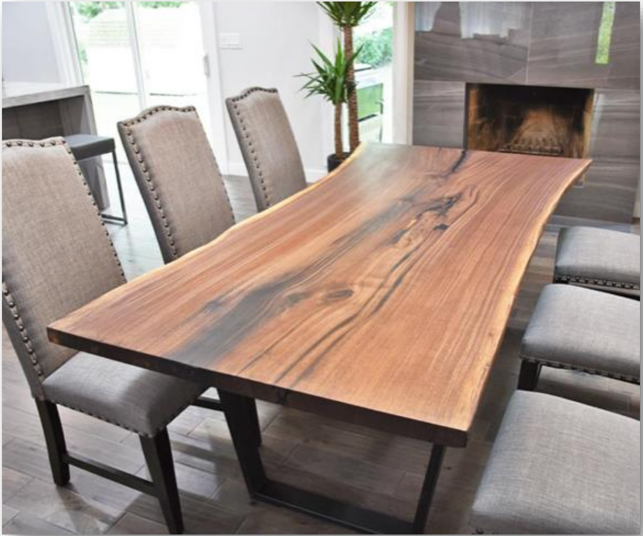
Figure 7. This slab shows many years of veneer quality growth covering the donut hole of an ugly youth.